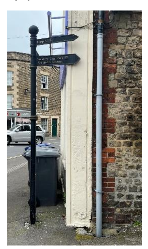
Fig. 1. Example of WTC Pedestrian Signage